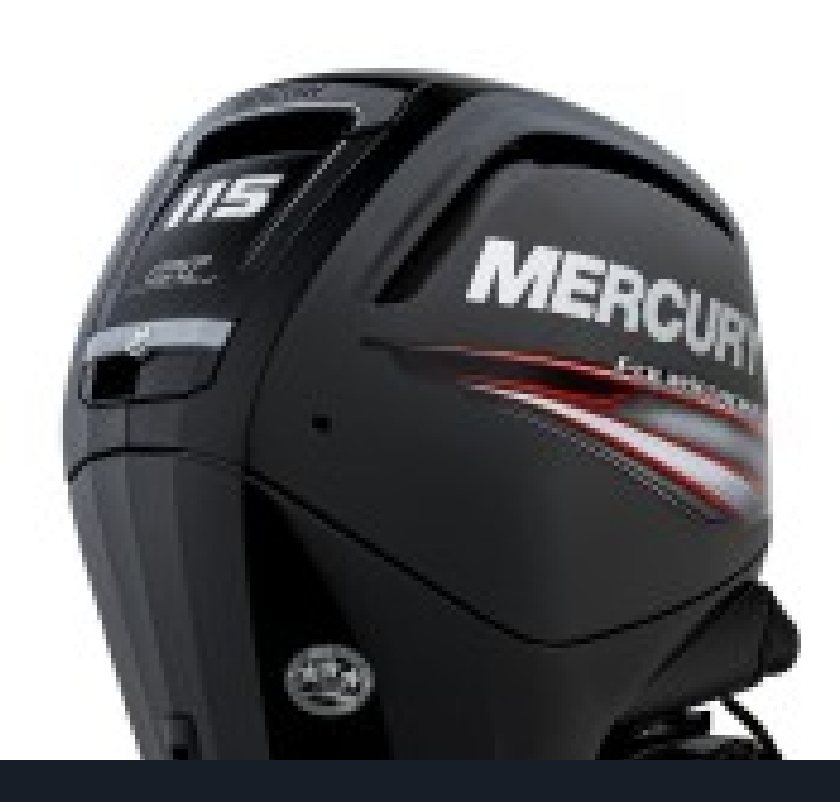
115 HP EFI CT Fourstroke