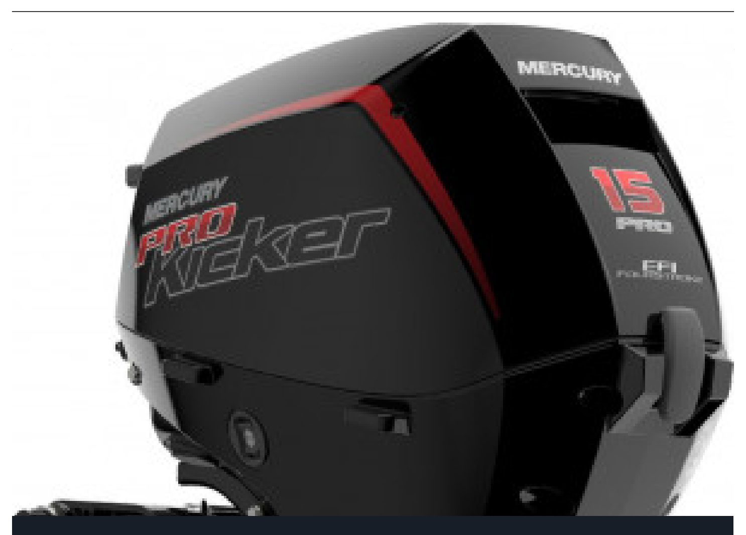
15 HP Pro Kicker EFI Fourstroke