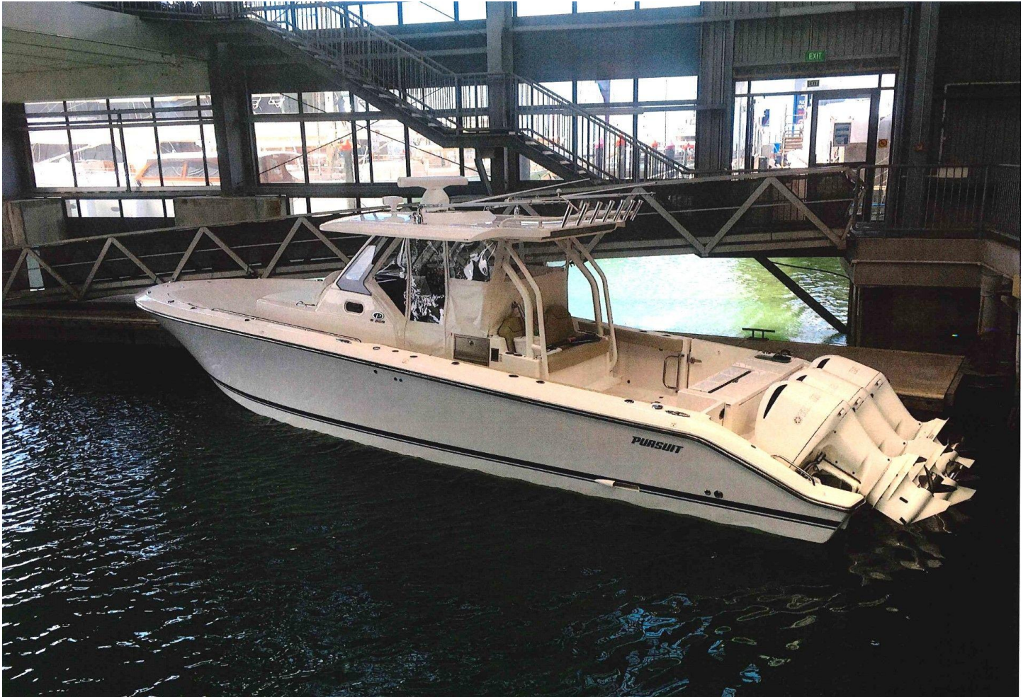
2018 Pursuit S368