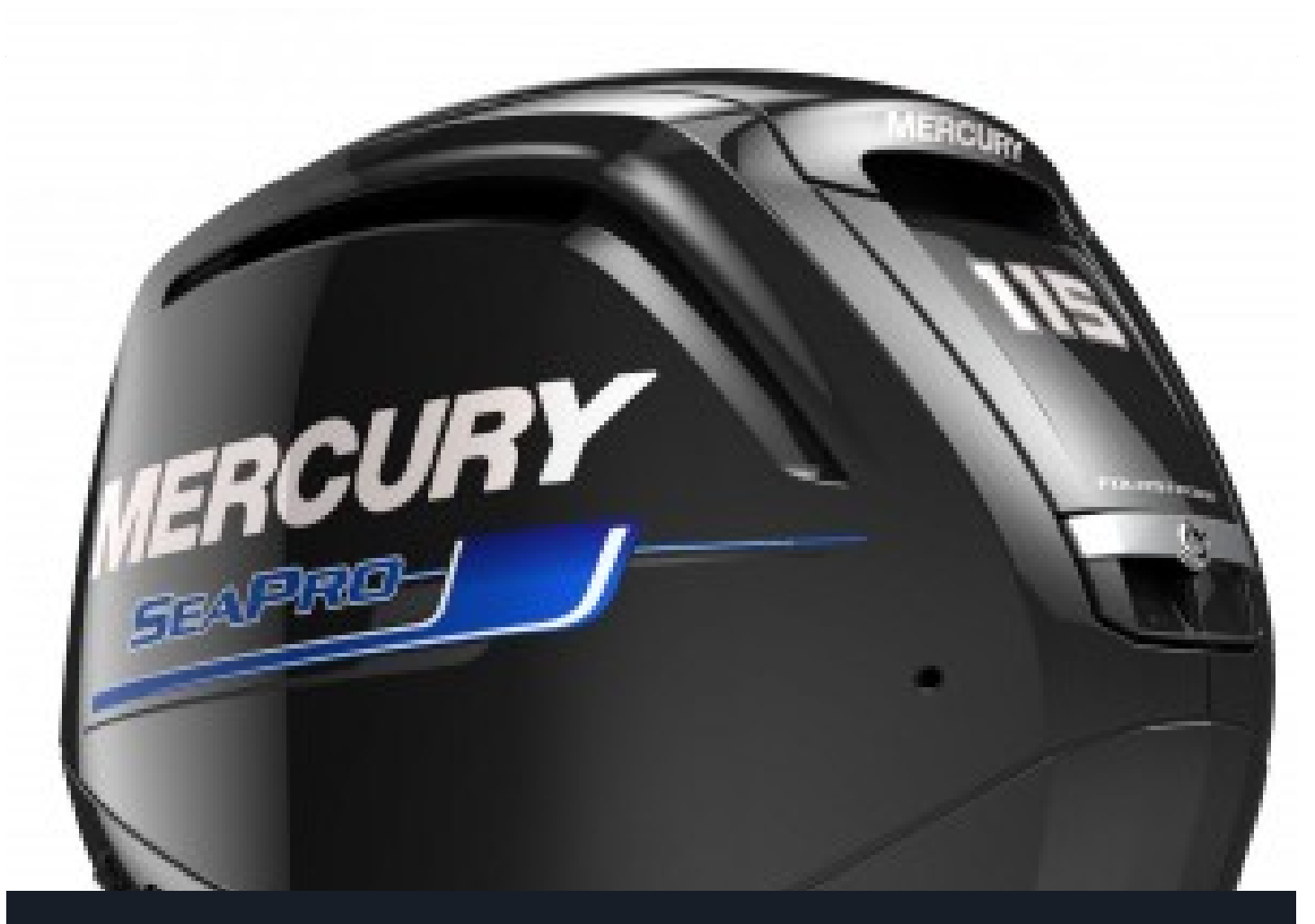
Mercury 115 HP Sea Pro Fourstroke